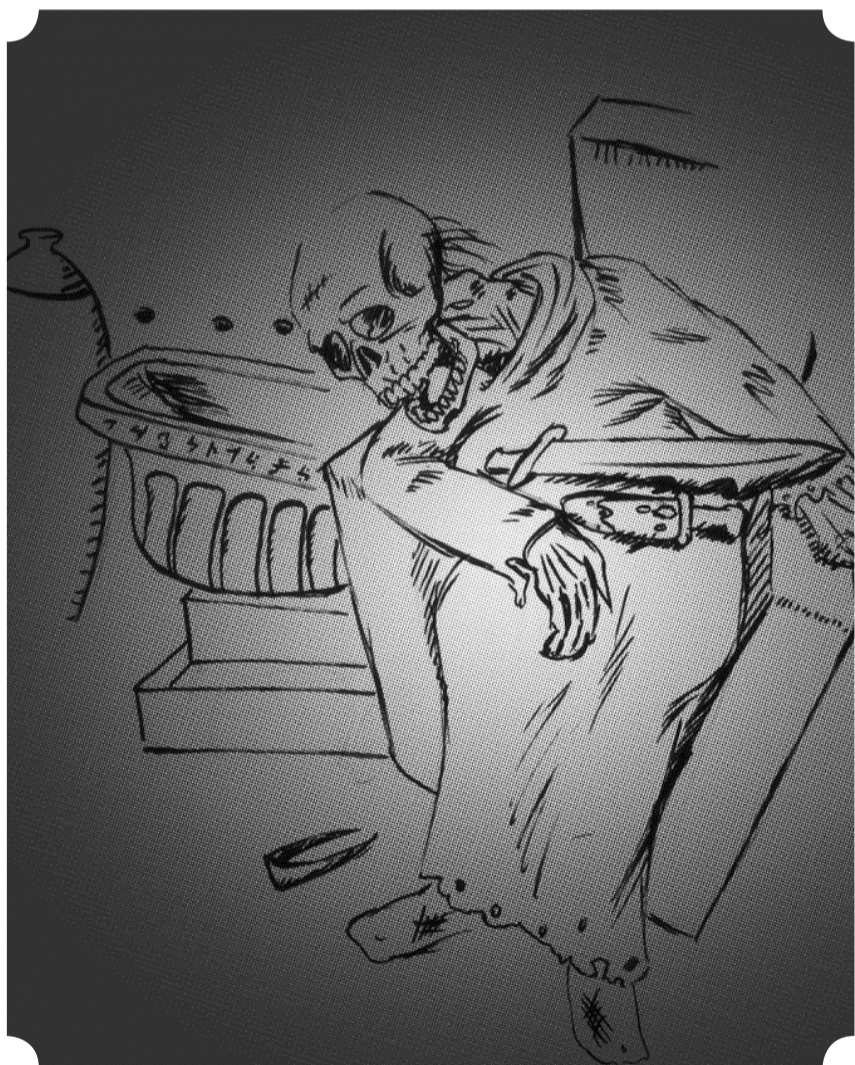
Corpse King by Claytonian JP

This room is as Room 11, with 5 more Carls.