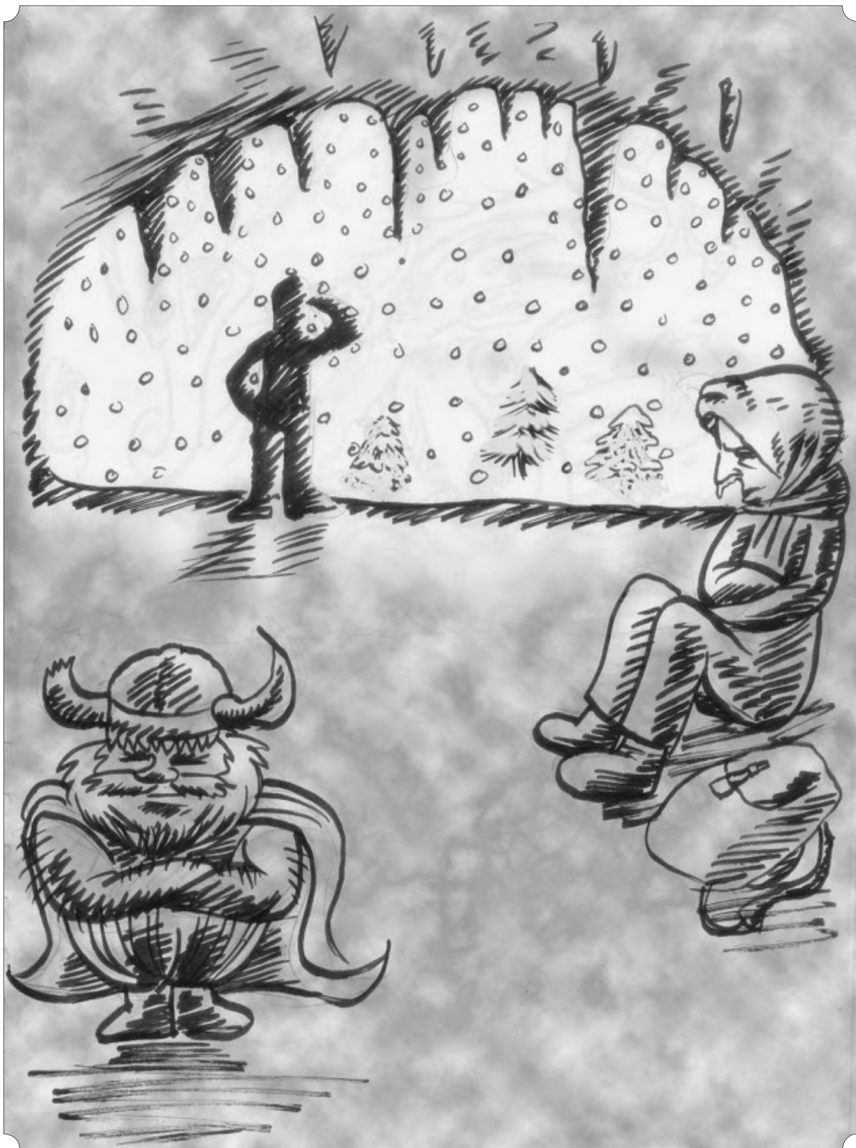
Cold Adventuring Party by Claytonian JP

This PDF is dedicated to all Old School, New School and awesome DIY Players and GMs out there across the globe.