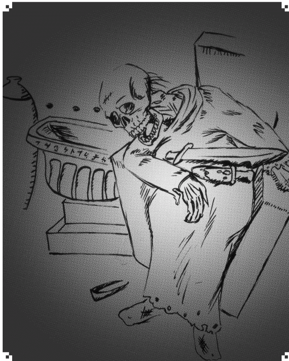
Corpse King by Claytonian JP